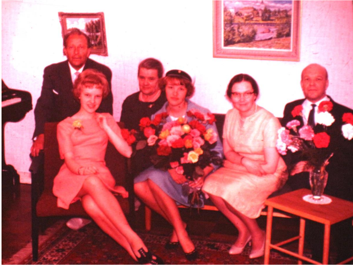
Mummi & Ukki