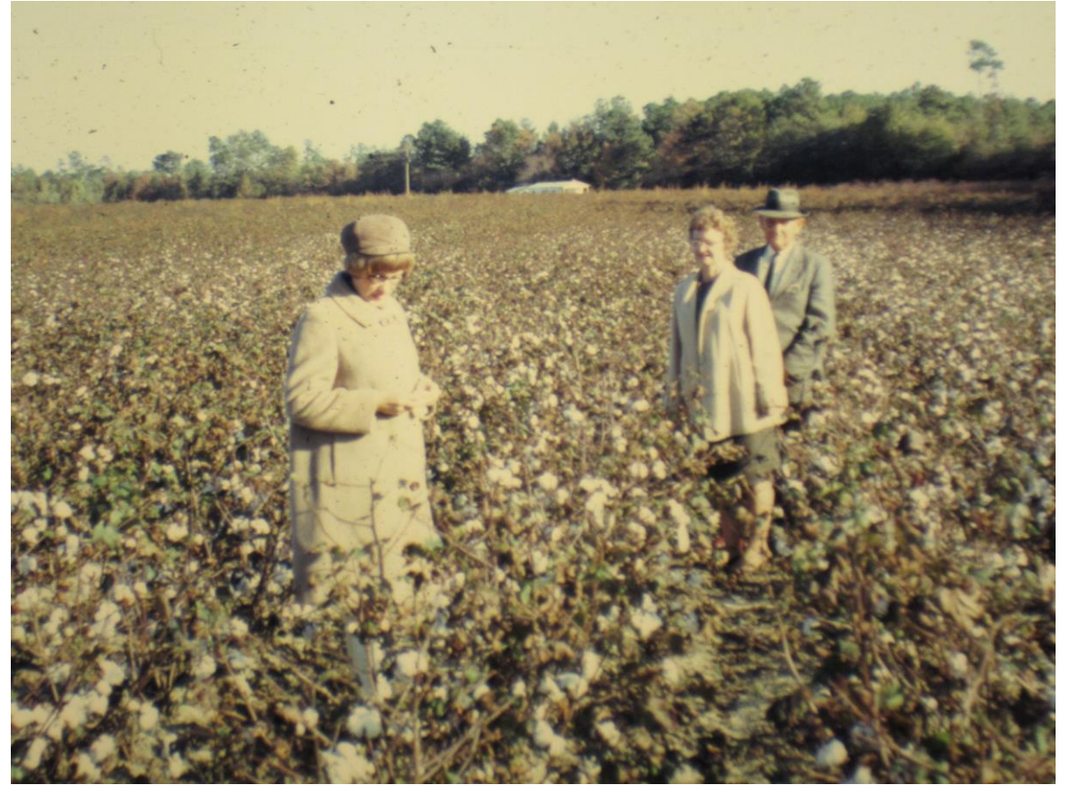
Grandmother & Granddaddy